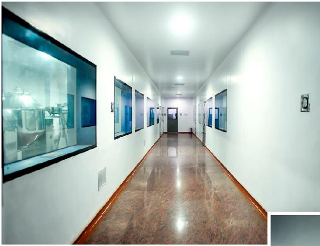
Walkway & Inner view of our API Plant