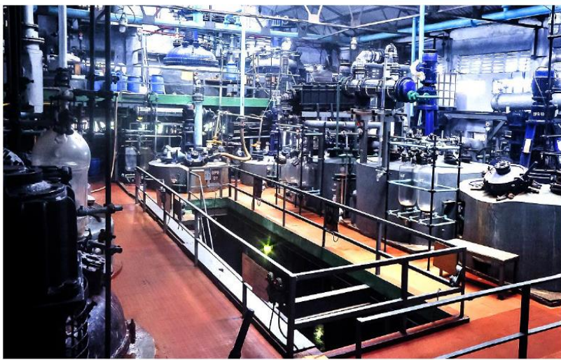
Inner view of Intermediate Plant